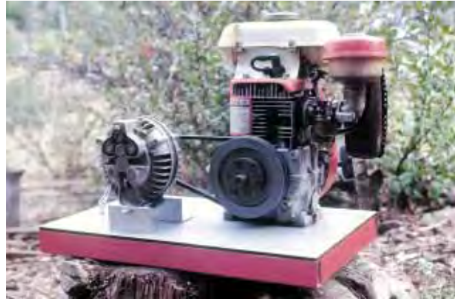
Above: This engine/generator uses a Chrysler 70 Ampere alternator.

Every RE system should have at least one power source capable of recharging the batteries at between C/10 to C/20 rates of charge. For example, a battery pack of 700 Ampere-hours periodically needs to be recharged at a minimum of 35 Amperes (its C/20 rate). To figure the C/20 rate for your pack, simply divide its